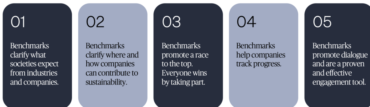
Figure 4: The above five benefits of benchmarking are from the World Benchmarking Alliance, of which Textile Exchange is a proud ally. For further details visit the World Benchmarking Alliance here .