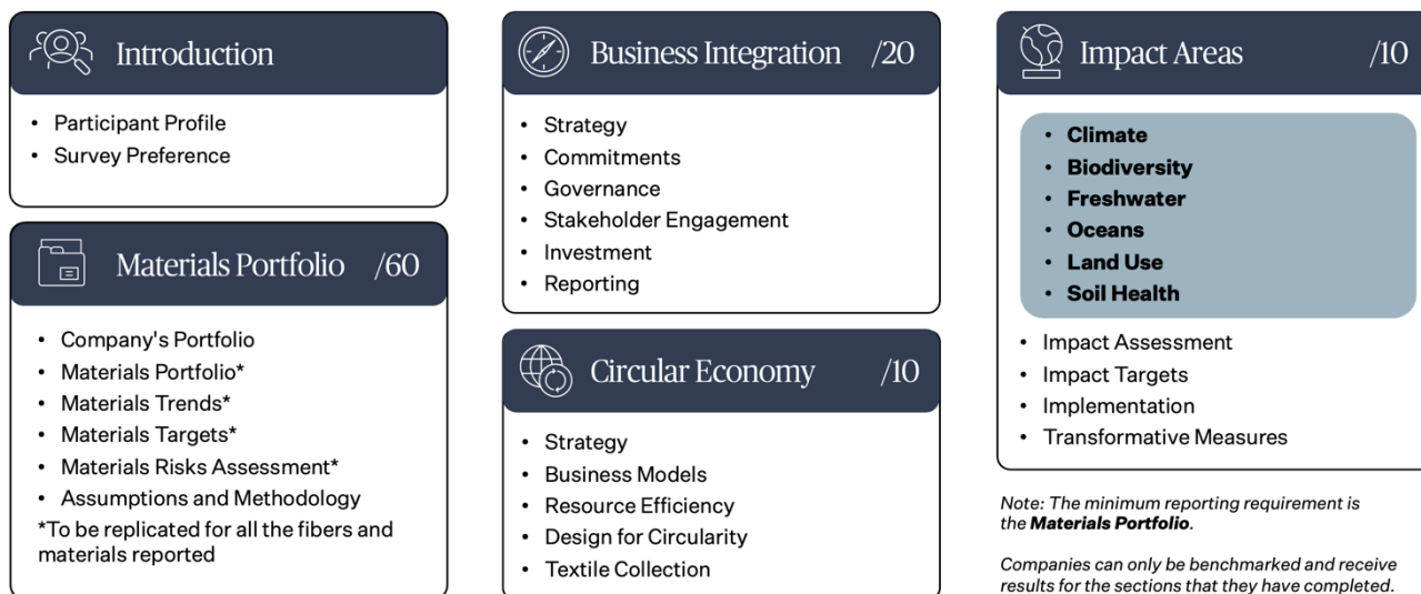
Figure 3: Materials Benchmark framework

The 2023-25 Materials Benchmark survey comprises three sections: Materials Portfolio , Business Integration & Circularity , and Impact Areas , which are further divided into subsections indicated in the image below: