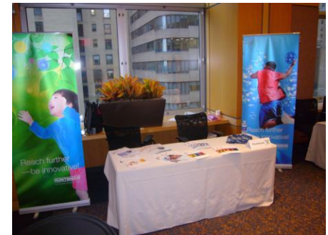
Sample Photos from past Textile Exchange Conferences